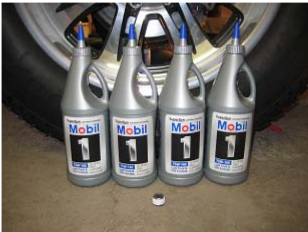
Drain Plug taped, and the new oil ready to go.