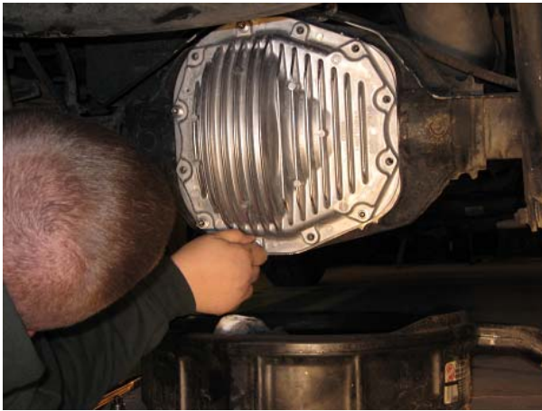
Installing the bolts after lining up the holes.