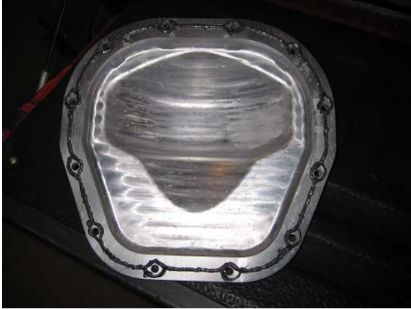
Here you can see the new Gasket.